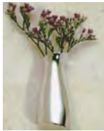
JSR VASE PINS Available for Sale, $80 each